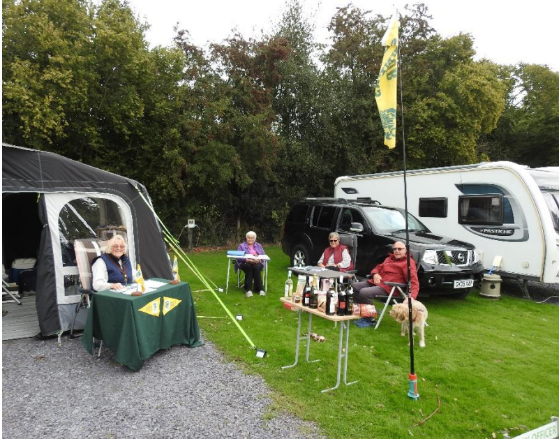
Waiting for the members.

It appeared to go well, and everyone seemed happy with the way the AGM was conducted.